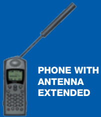
PHONE WITH ANTENNA EXTENDED